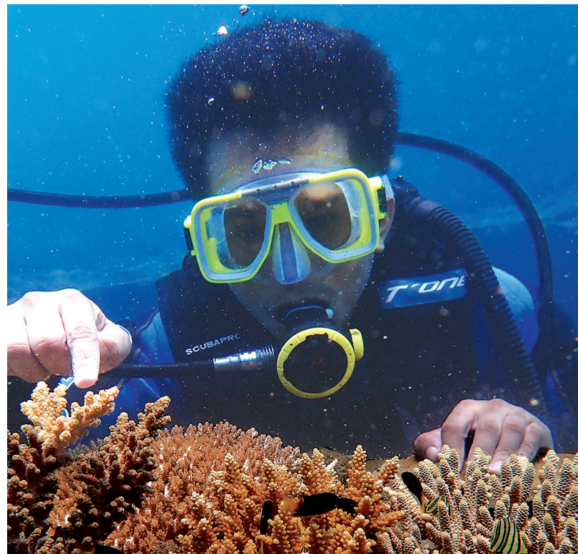
Rotary members partnered with local fishermen to build an artificial reef that helped save the fishing industry in Atimonan, Quezon Province, Philippines.

#NatureForAll publication, Home to Us All: How Connecting With Nature Helps Us Care for Ourselves and the Earth: https://www.researchgate.net/publication/330980975 wildfor.life