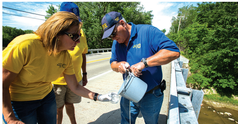
Members of the Rotary Club of Waterville, Ohio, USA, draw water samples from a stream leading into the Maumee River in Bowling Green, Ohio. Rotary clubs in Ohio and Canada near Lake Erie are addressing water contamination by testing water, sharing results, and collaborating with residents and community leaders to advocate for improved water quality.