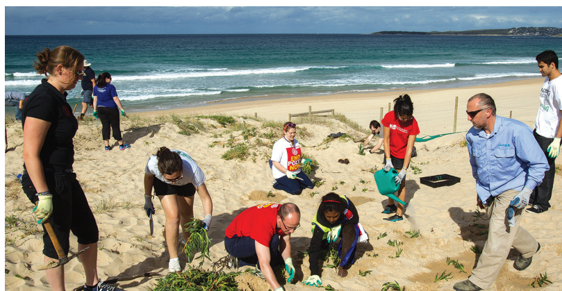
Rotaractors and other volunteers clean the beach and plant grasses to prevent erosion at Wanda Beach in Cronulla, NSW, Australia. Rotaract Preconvention Meeting.

The benefits of plastic are undeniable. The material is cheap, lightweight, and easy to make. These qualities have led to a boom in the production of plastic over the past century. Plastic packaging helps reduce food waste by extending shelf life. However, with this boom has come a major downside: plastic pollution. It is one of the biggest environmental challenges of our time. Each year, about 8 million tonnes of plastic enters the ocean from rivers, creeks, and drains, and ends up either floating on the surface or deposited on beaches or in ocean sediment. 1 As plastic is designed to be durable, waste plastic can last a very long time in the natural environment. Plastic can harm marine life: animals, such as seals, dolphins, and sea turtles become entangled in plastic fishing lines, nets, and bags. They also ingest plastic, mistaking it for food, which kills them. In addition, recent studies show that over 90% of bottled water and even 83% of tap water contain microplastic particles 2 and trace amounts are increasingly detectable in our blood, stomachs, and lungs.