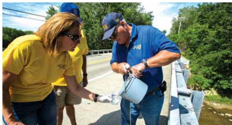
Members of the Rotary Club of Waterville, Ohio, USA, draw water samples from a stream leading into the Maumee River in Bowling Green, Ohio. Rotary clubs in Ohio and Canada near Lake Erie are addressing water contamination by testing water, sharing results, and collaborating with residents and community leaders to advocate for improved water quality.