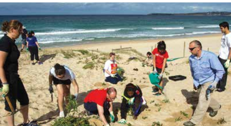
Rotaractors and other volunteers clean the beach and plant grasses to prevent erosion at Wanda Beach in Cronulla, NSW, Australia. Rotaract Preconvention Meeting.

The benefits of plastic are undeniable. The material is cheap, lightweight, and easy to make. These qualities have led to a boom in the production of plastic over the past century. Plastic packaging helps reduce food waste by extending shelf life. However, with this boom has come a major downside: plastic pollution. It is one of the biggest environmental challenges of our time. Each year, about 8 million tonnes of plastic enters the ocean from rivers, creeks, and drains, and ends up either floating on the surface or deposited on beaches or in ocean sediment. 1 As plastic is designed to be durable, waste plastic can last a very long time in the natural environment. Plastic can harm marine life: animals, such as seals, dolphins, and sea turtles become entangled in plastic fishing lines, nets, and bags. They also ingest plastic, mistaking it for food, which kills them. In addition, recent studies show that over 90% of bottled water and even 83% of tap water contain microplastic particles 2 and trace amounts are increasingly detectable in our blood, stomachs, and lungs.