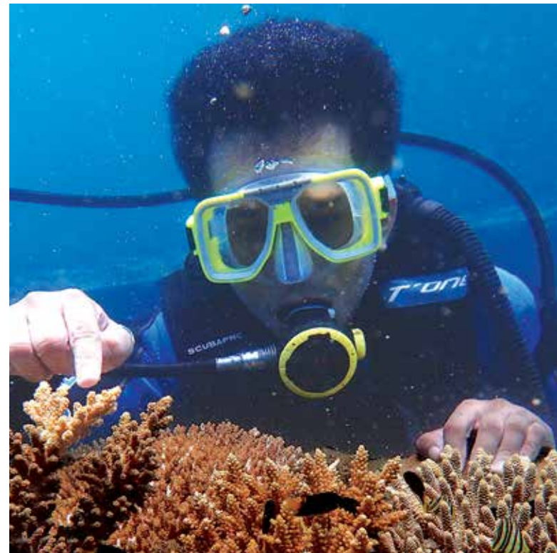
Rotary members partnered with local fishermen to build an artificial reef that helped save the fishing industry in Atimonan, Quezon Province, Philippines.